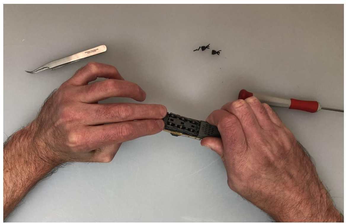
Step 2: Hold the model upside down by the fuel tank and press down on the bottom edge of the walkway.