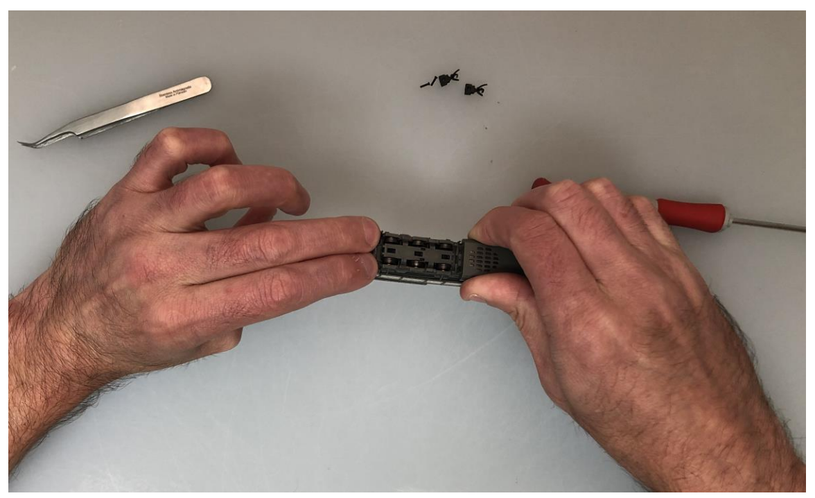
Alternate to the other side and do the same thing.